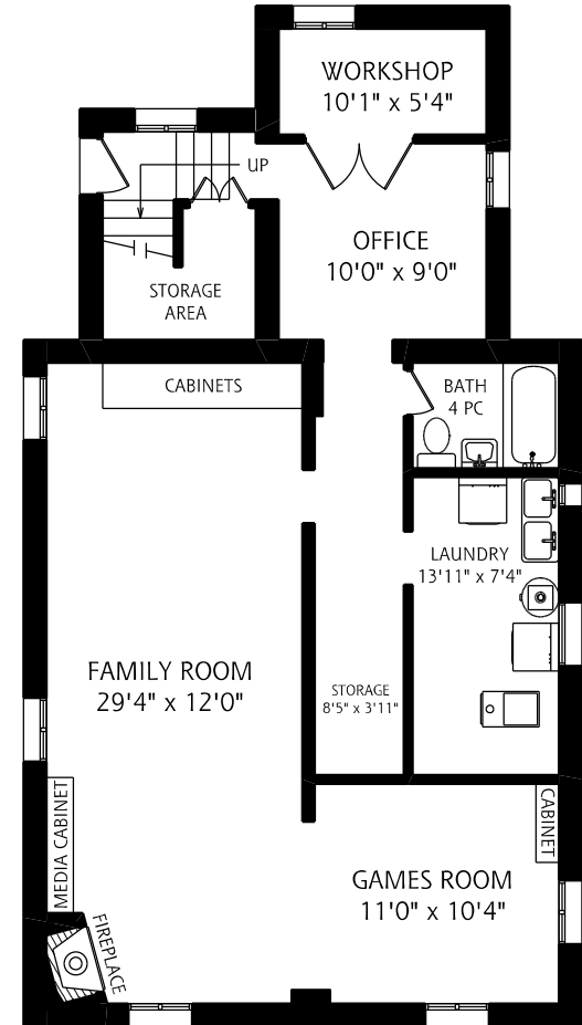
LOWER LEVEL 1,135 SQUARE FEET