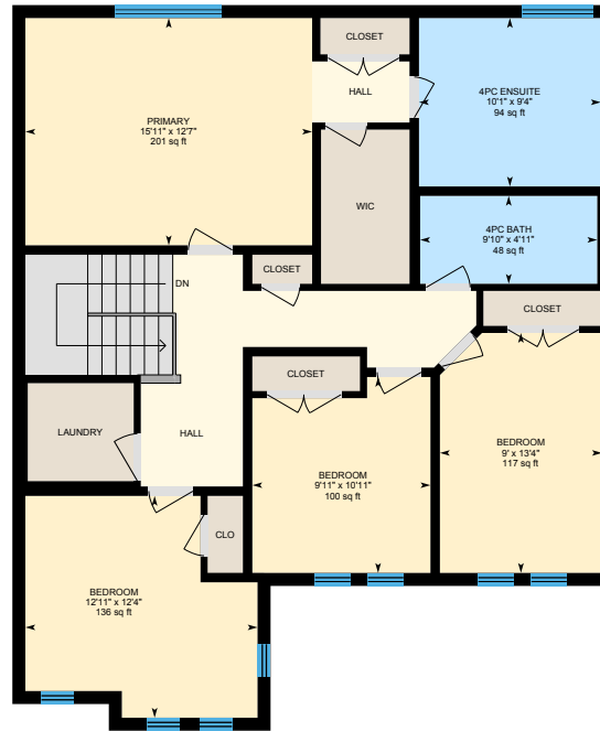
2nd Floor Exterior Area 1184.45 sq ft