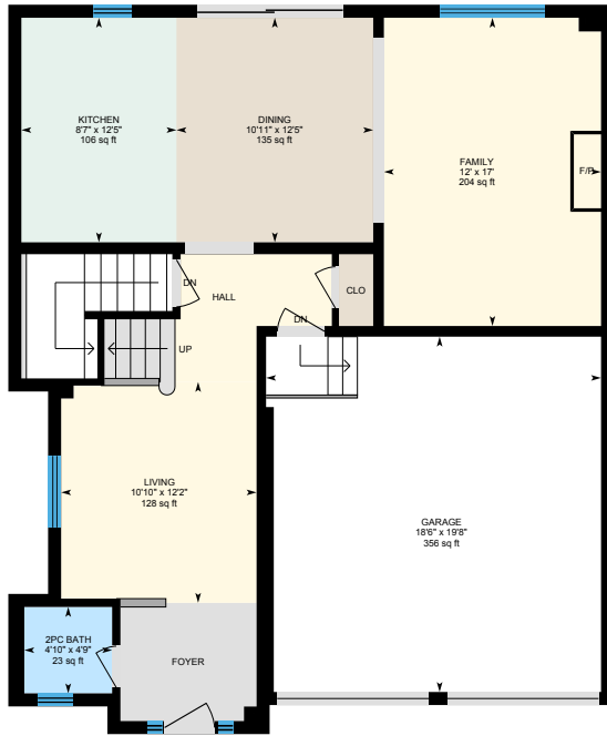
Main Floor Exterior Area 900.51 sq ft

Main Building: Total Exterior Area Above Grade 2084.97 sq ft