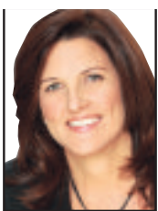
Royal LePage Real Estate Services Ltd.