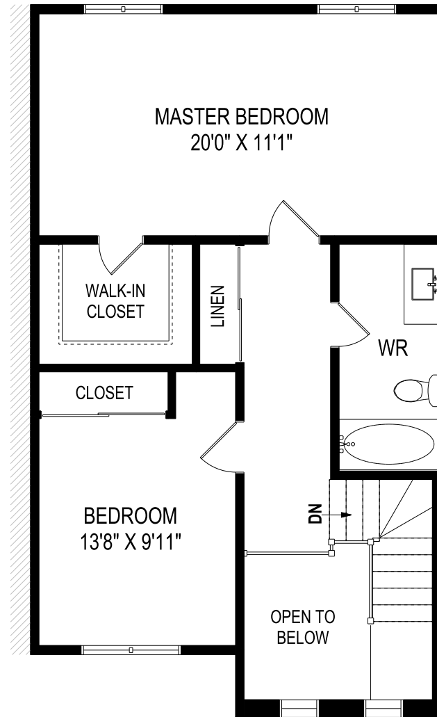
SECOND FLOOR 655 SQUARE FEET AREA EXCLUDES 58 SQUARE FEET OPEN TO BELOW SPACE