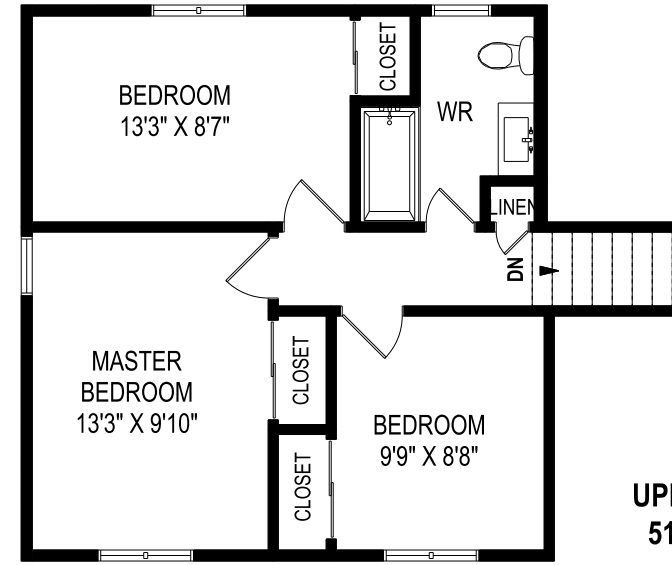
UPPER FLOOR PLAN 515 SQUARE FEET