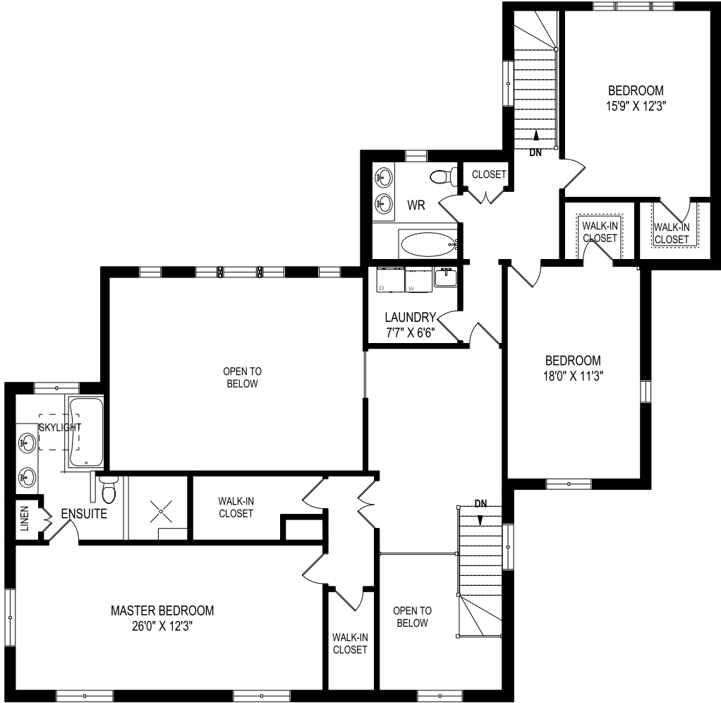
SECOND FLOOR PLAN 1800 SQUARE FEET AREA EXCLUDES 444 SQ.FT. OPEN TO BELOW SPACE