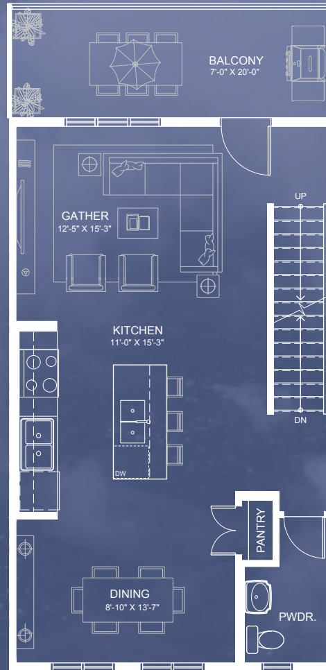
MAIN LEVEL ±689 SQ. FT.